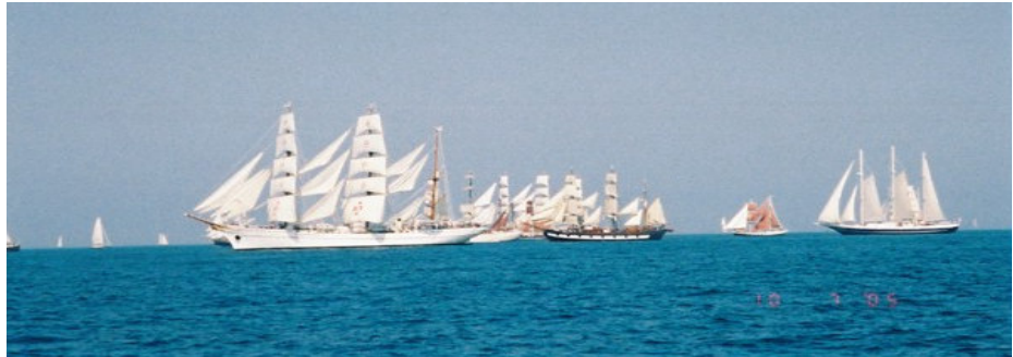
Tall Ships Race (see article)