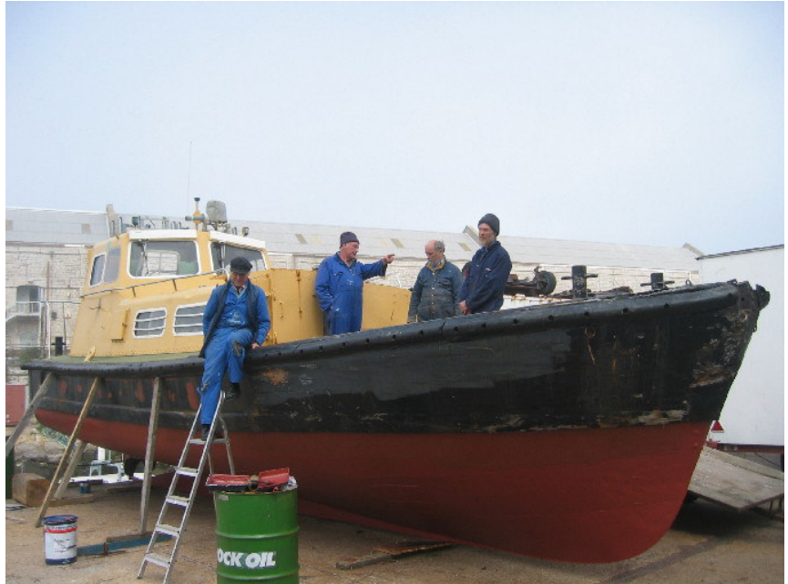
New moorings boat. See page 6