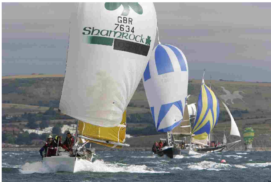
Weymouth Regatta 2006