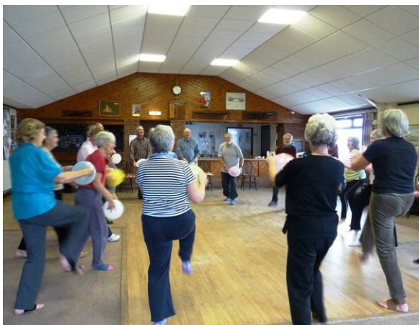
Exercise group at Christmas