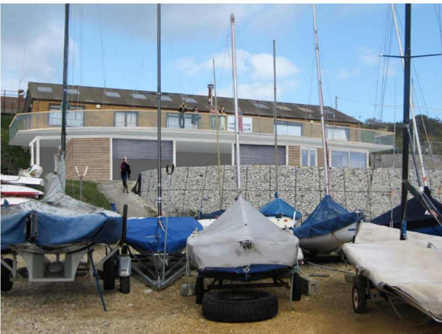
Mock-up of the new extension